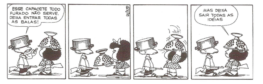
Frame 1: This helmet, all pierced, is useless. It lets the bullets come in.