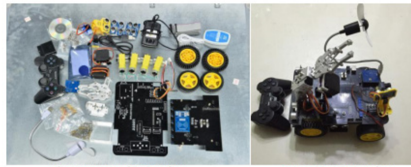
Components of Robot Car Assembled Robot Car Figure 1 Robot Car Used in the Course

8) Implementation of flame sensor and participating in the fire extinguishment competition.