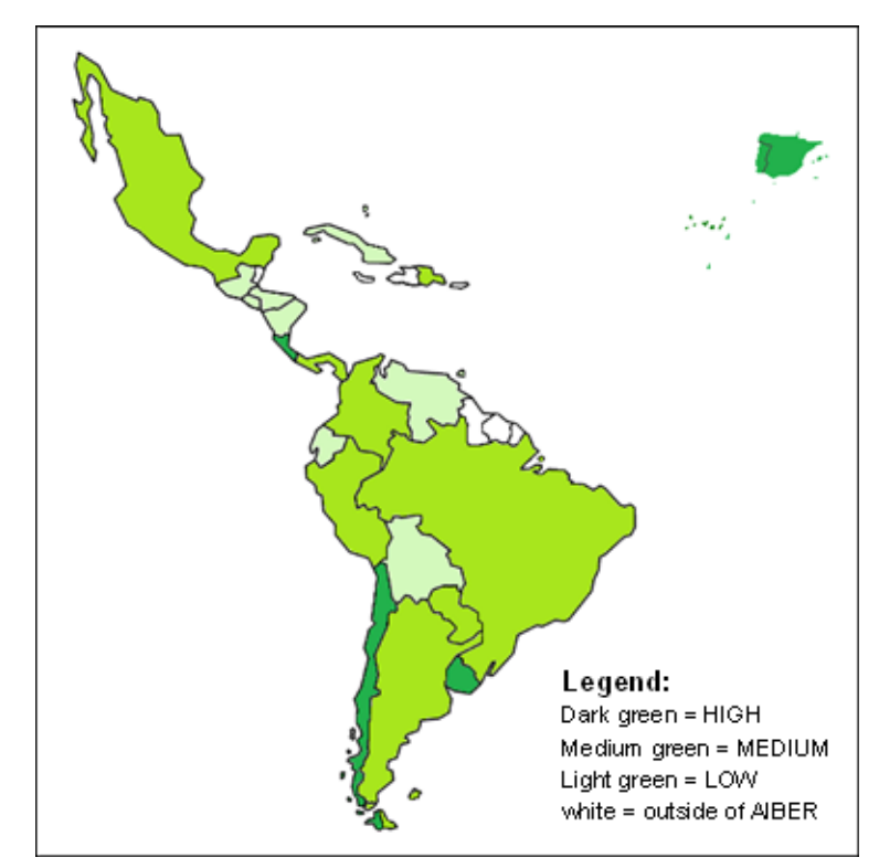
Figure 1. Classification map of the countries of Ibero-America – AIBER

We can say that due to closeness of the results in the ANOVA analysis, grouped to the countries of the clusters 2 and 3 in the table 4, it shows as "MEDIUM" on the ranking scale of countries AIBER. Figure 2 shows the map with the classification countries.