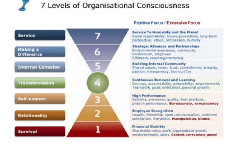
Figure 1. The seven levels of personal and organizational awareness

From needs as described by Maslow, Barrett (2006) developed a model with seven levels of consciousness to measure the values of an organization / company. According to the author the companies and firms with more self-performance are those that establish and preserve a worshiper guided by shared values, which all seek the same future vision, personal fulfillment and meet their physical, emotional, mental and spiritual needs. Barrett (2006) reveals seven levels of personal and social consciousness described in Figure 1.