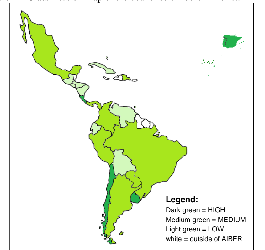
Figure 2 - Classification map of the countries of Ibero-America - AIBER

We can say that due to closeness of the results in the ANOVA analysis, grouped to the countries of the clusters 2 and 3 in the table 4, it shows as "MEDIUM" on the ranking scale of countries AIBER. Figure 2 shows the map with the classification countries.