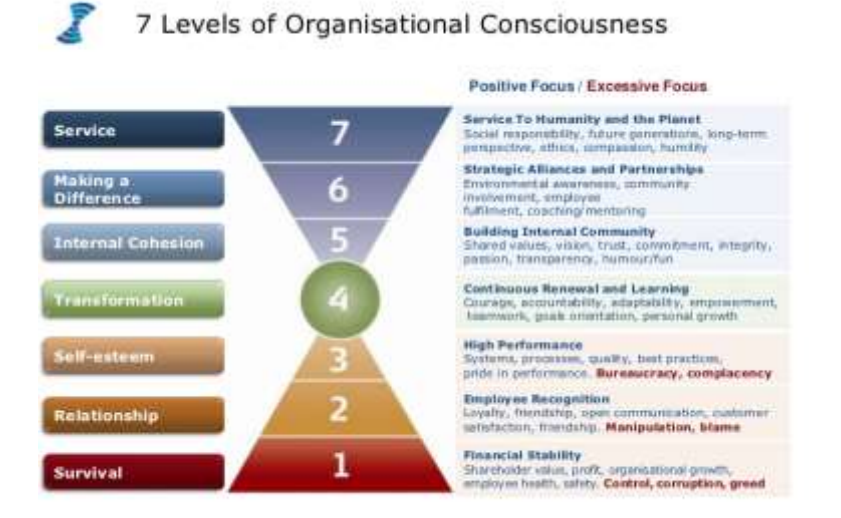
Figure 1. The seven levels of personal and organizational awareness.

From needs as described by Maslow, Barrett (2006) developed a model with seven levels of consciousness to measure the values of an organization / company. According to the author the companies and firms with more self-performance are those that establish and preserve a worshiper guided by shared values, which all seek the same future vision, personal fulfillment and meet their physical, emotional, mental and spiritual needs. Barrett (2006) reveals seven levels of personal and social consciousness described in Figure 1.