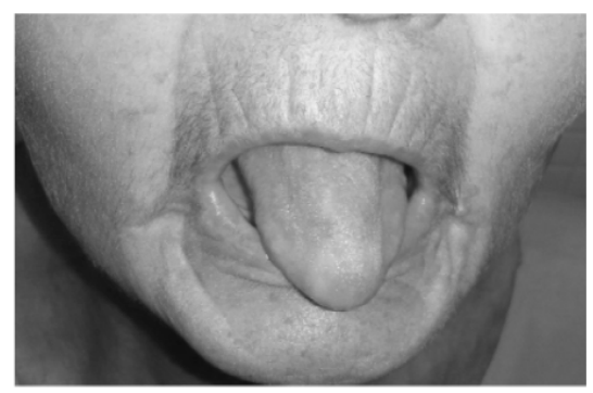
Figure 1. Telangiectasia on the face, lips and tongue

arms, face and body<sup>25</sup>. They develop mainly in exposed cutaneous regions of the hands and face and can also be found in the oral mucosa, as in lips and tongue (Figure 1).