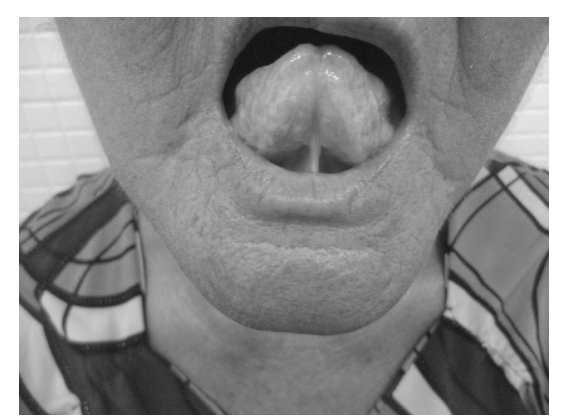
Figure 2. Tongue tip in heart format, thick and short frenulum

the mouth without touching the palate was altered in three individuals of the SG, and of these, two presented the tip of the tongue in heart shape<sup>11</sup> (Figure 2), probably due to the frenulum alteration<sup>9, 11</sup>.