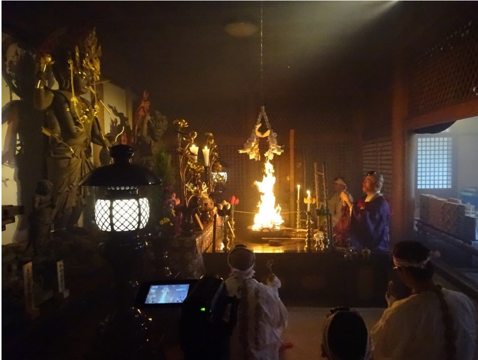
Figure 2. Filming the fire ritual : the inner temple hall, from interdiction to permission.

A significant aspect of the practice is that, notwithstanding whether rules could be negotiated or not, their source, that is their Sender actant, was the deity itself , or the leader and elder members as its delegates. Actions like crossing an interdicted space, taking pictures without permission, looking at secret buddhas, or even cleaning sacred effigies with impure cloths and water, were considered as highly disrespectful ( shitsurei ) against the deity Hōki bosatsu and other “living icons”. Like in the rest of Buddhist traditions in Asia — as documented by ample literature on the topic — such icons are in fact considered as active and concrete sacred presences inside the space of the temple 41 .