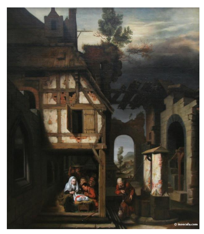
Illustration 3 . Nicolaes Maes, Adoration of the Shepherds , ca. 1658–1660. Oil on canvas. Los Angeles: J. Paul Getty Museum. 119.2 x 94.8 cm.

Another of Maes' paintings, an Adoration of the Shepherds , through a direct rehearsal of Giotto's composition, including its walls, also portrays just such a listening character who breaches the boundary between inside and out (Illustration 3).