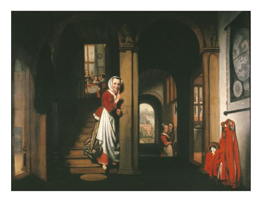
Illustration 8. The Eavesdropper (MAES, 1657). Oil on canvas. Dordrechts Museum (on loan from the Rijksdienst Beeldende Kunst of The Hague). 92.5 x 122 cm.

Only when these (and other) elements have been put into place will Maes the painter be ready to undertake his eavesdropper works in a context of dialogic curiosity. In addition to the elements we have just described, the curious eavesdropper painting needs to adopt certain fundamental ambiguities in its iconic language (Illustration 8).