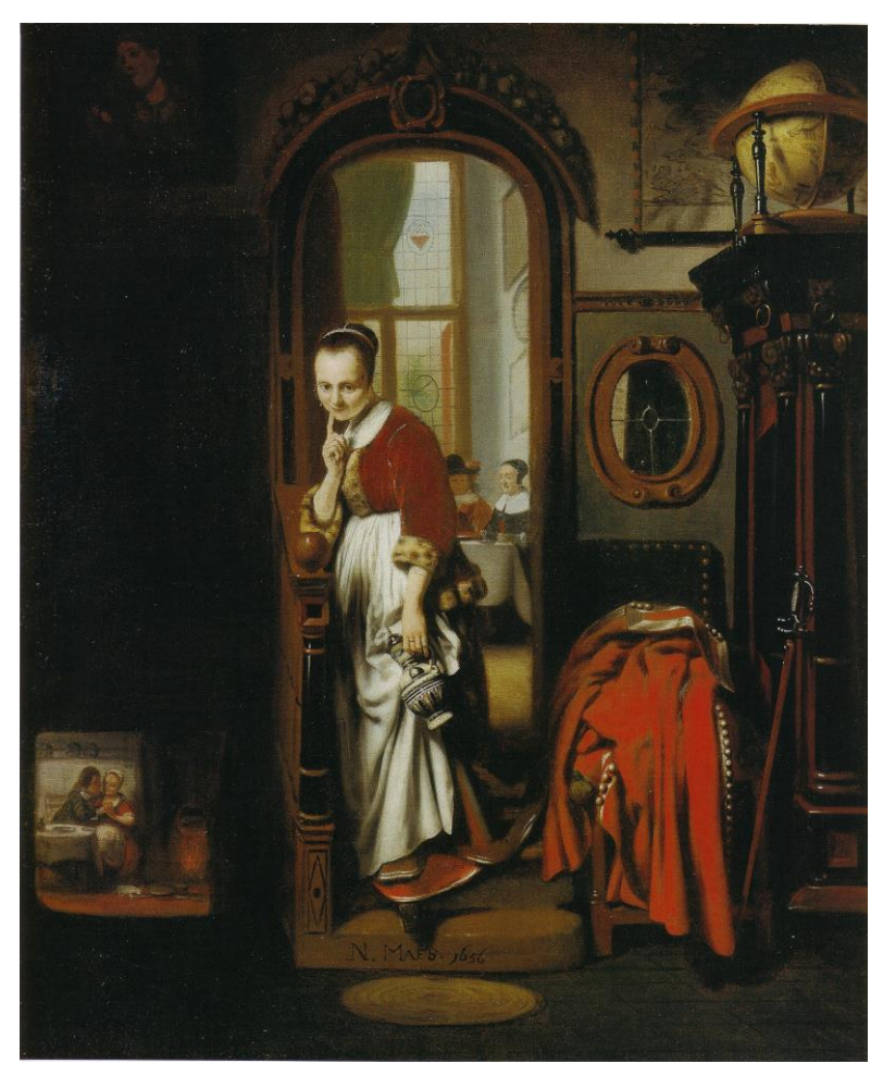
Illustration 1 . Nicolaes Maes, The Eavesdropper (The Listening Housewife) , 1656. Oil on canvas. London: Wallace Collection. 84.7 x 70.6 cm.

our right of the doorway. It can be paraphrased more or less as asking the beholder to observe in detail, from his or her privileged viewpoint, what she, the painted character, cannot see from the vantage point in which she is trapped. That she is caught between two worlds in the vestibule of her house (a space referred to in seventeenth-century Dutch by the chronotopically significant word voorhuis )<sup>4</sup> is represented by Maes by putting her in between two very different scenes, one unfolding in the background, above, which shows what might be a rather boring set of visitors<sup>5</sup> and the other visible below, in the cellar, which shows a flirting scene between, presumably, two of the family's servants.