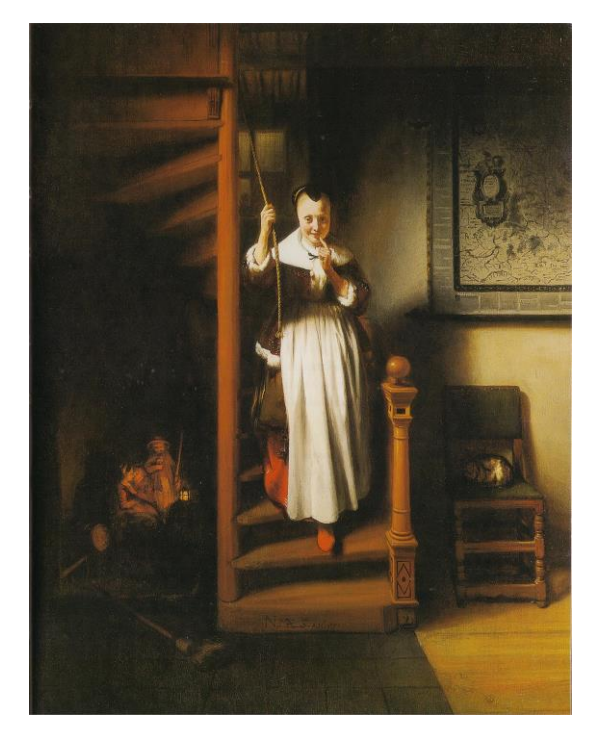
Illustration 6 . Nicolaes Maes, The Listening Housewife , 1655. Oil on wood panel. London: Buckingham Palace (Royal Collection). 74.9 x 60.3 cm.

In what is sometimes claimed to be the simplest of the eavesdropper paintings,<sup>23</sup> the listening housewife of the Royal Collection (Illustration 6) demands that we understand the implicitly exchanged words between painted character and invisible beholder in a peculiar way.