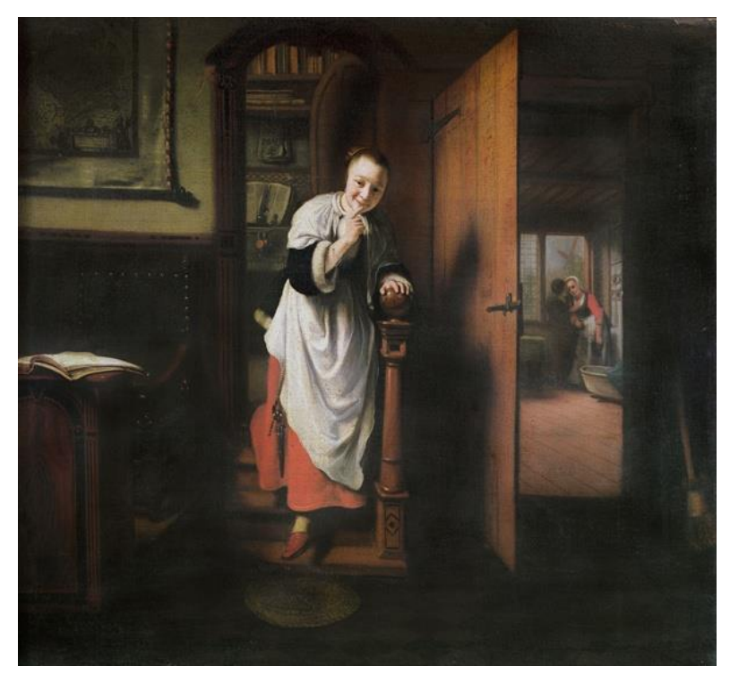
Illustration 9 . The Eavesdropper on two Lovers (Allegory of the sense of Hearing) (MAES, ca. 1656-57). Oil on canvas. London: Apsley House (Piccadilly Room). 57.5 x 66 cm.

We have not yet spoken of the second-last eavesdropper that Nicolaes Maes painted (Illustration 9), a composition which comments, as does the Boston panel, on an interrupted act of working with a book. It is of course tempting to say that the painting of open books merely constitutes a playful allusion to the multiple portraits of the Dutch Golden Age, where someone, young or old, is depicted in the act of reading. And yet the Apsley House painting does something more than merely allude to contemporary artists, much more than suggest a parodic link with those hundreds of Annunciation paintings, which also show a young maiden caught in the act of reading.