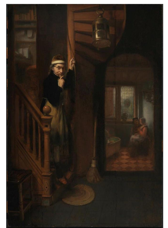
Illustration 5. Nicolaes Maes, The Eavesdropper , ca. 1655–56. Oil on wood panel. Boston: Museum of Fine Arts. 72.4 x 52.1 cm.

He is on his way down a winding stairway, made ostensibly of wood, therefore experiencing great difficulty in not making too much noise. One must, of course, consider that he may be wearing wooden-soled house shoes and, even if he is wearing linen slippers, the wooden stairs are bound to creak. Too much noise would naturally startle the man and woman visible in the small room to our right. In order for the eavesdropper painting to function, the spied upon couple must not know that they are being watched.<sup>20</sup> Not only is the eavesdropper being careful not to make any noise, but something else is bothering him, perhaps a sound, perhaps a surprising turn of events issuing from his right, or even from his left, maybe a sign of movement he was not