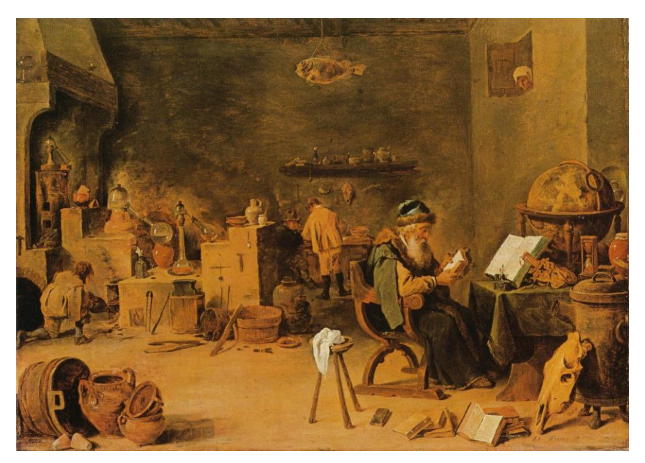
Illustration 2. David Teniers, The Alchemist , mid-17<sup>th</sup> Century. Oil on wood panel. Brunswick: Herzog Anton Ulrich-Museum. 50.7 x 71.2 cm.

Another of Maes' paintings, an Adoration of the Shepherds , through a direct rehearsal of Giotto's composition, including its walls, also portrays just such a listening character who breaches the boundary between inside and out (Illustration 3).