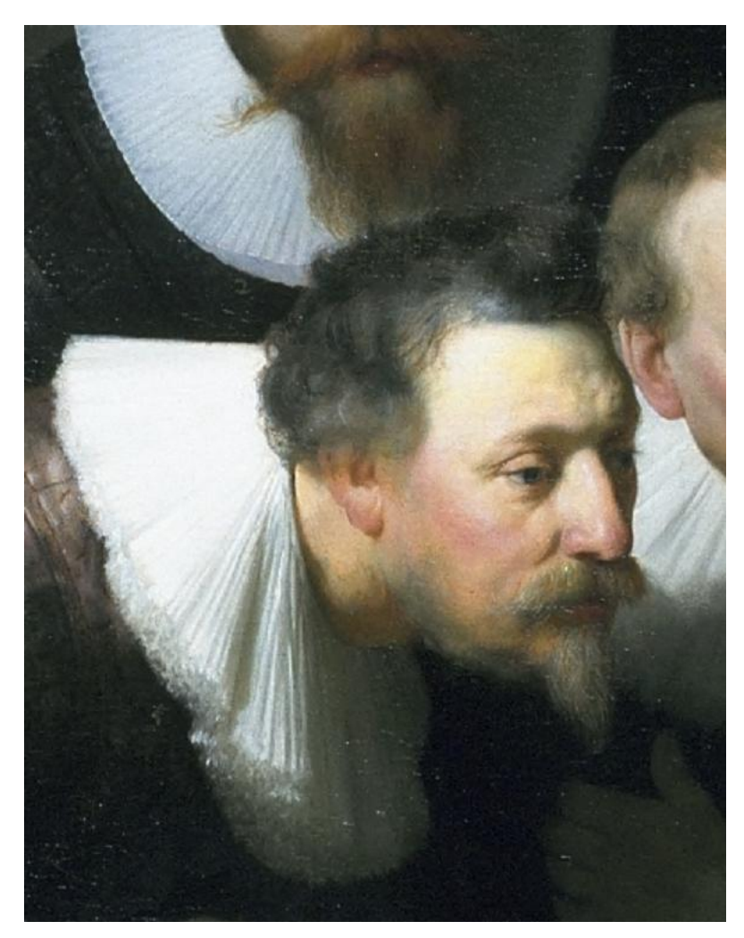
Illustration 7. Rembrandt, detail from Anatomy Lesson of Doctor Nicolaes Tulp , 1632. Oil on canvas. The Hague: Mauritshuis. 169.5 x 216.5

Significantly, however, both of these types of curiosity leave behind the fundamentally "dialogic" nature of the ancient notion of curiosity, the one based on civilized cura , and very much present within Renaissance notions of polite conversation. It is important therefore to understand that the third type of curiosity, the older one based on cura , had not yet been entirely forgotten in seventeenth-century Europe, despite the increasingly aggressive character of the moralizing and scientific forms. In religious iconology, it takes on a multi-sensorial dimension, for example in paintings that depict Christ's Noli Me Tangere encounter with Mary Magdalene. The positive examples of dialogic curiosity, within seventeenth-century religious art, stand in stark contrast with its negative forms, both monologic and objectifying in nature, which can be seen in the numerous paintings depicting Suzanne and the two Elders. In contrast to such works, Nicolaes Maes' eavesdropper paintings represent a secularized