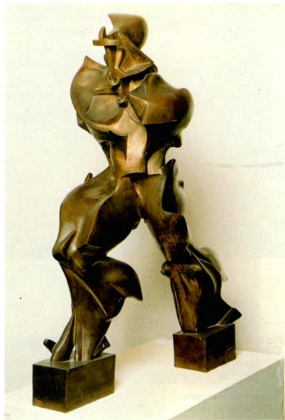
Image 1: BOCCIONI, Forme uniche nella continuità dello spazio (1913)