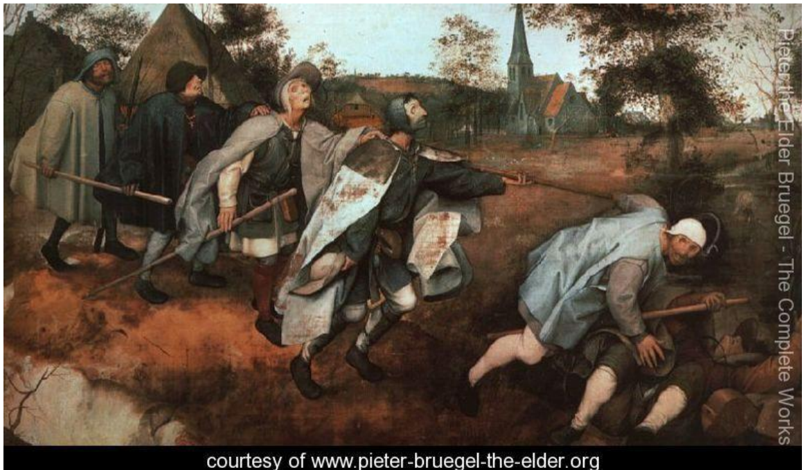
The Blind Leading the Blind , Pieter Bruegel, the Elder, 1568