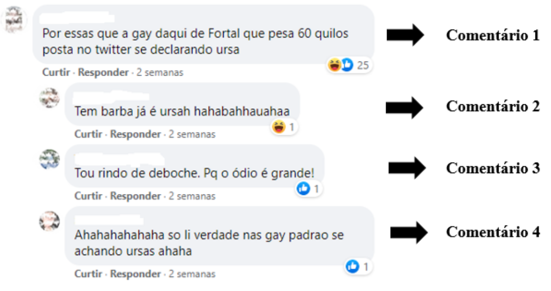
Figure 2: Sequence of commentaries 1.

commentaries generated in the group. For this reason, and the title of illustrations, I present the following: the analysis of three sequences of commentaries that respond in an immediate way to the post. Supported by Bakhtin's (1990)<sup>27</sup> idea that the problem of the body must be studied from the point of view of values, I analyze the evaluations in the commentaries that, on relating dialogically, constitute the meanings of the bear body in the discursive interactions of the members of the group on responding to the post on screen.