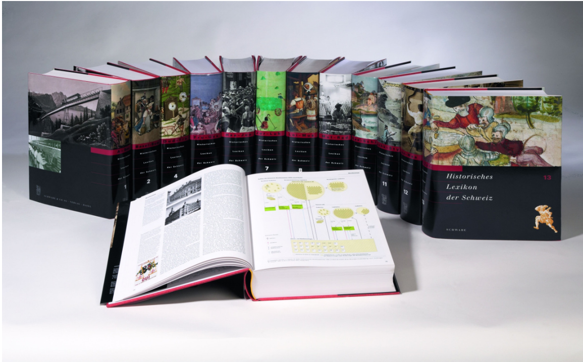
Fig. 2 The thirteen volumes of the German print edition of the Historical Dictionary of Switzerland ( Historisches Lexikon der Schweiz , 13 vols. [Basel: Schwabe, 2002–2014])

which is spoken in the Grisons in the southeast of Switzerland, and the distinctive culture of its inhabitants, are represented by a supplemental two-volume partial edition in that language, with additional indexes in German and Italian. With its four parallel editions, the HDS is unique among national encyclopedias, at least as far as we know (Figure 2). 4