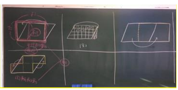
Figure 2. Students' presented methods for determination of area of parallelogram.

Four chosen students draw pictures of parallelograms and explain their solutions on the blackboard.