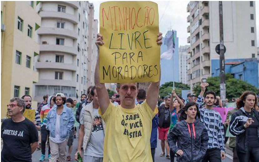
Author: Eduardo Anizelli/ Folhapress. Source: Gragnani, 2017.

The 2016 elections widened the gap between the opposing views on the city's development, reflecting the country's political divide. The left-wing Workers' Party lost the municipal elections to a neoliberal view of city management, with the victory of João Doria as the "entrepreneur mayor", a label that turned him into a leading figurehead of neoliberal rationality (Dardot and Laval, 2017; Pilotta, 2016).