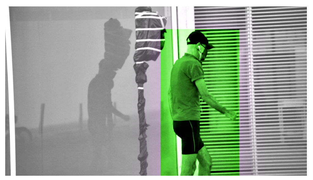
Figure 1 – Walking in the street wearing a mask

The city was a territory of dangerous exploitation, being appropriated at specific moments and only for the use of essential services. Public space, therefore, was used only for quick displacements, and there was no spontaneous or modifying appropriation of use. For the most worried, for example, a trip to the market could become "the moment", in the sense that it was one of the only moments in their daily lives when they could explore the city and, at the same time, "the moment", in the sense that it was a tense point, the moment of exposing their bodies to the danger of contamination that the city offered.