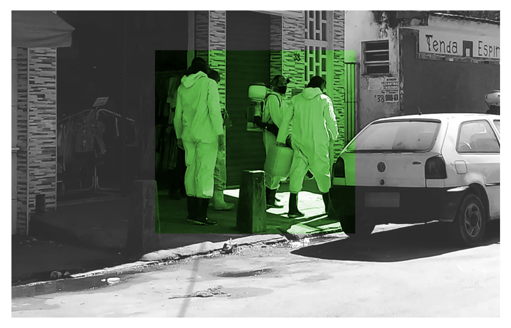
Figure 3 – Sanitization of streets and alleys in the Rio das Pedras favela, RJ

Inside part of the slums of Rio de Janeiro, during the guarantine, it was possible to observe some protective postures, such as the use of masks and some businesses only functioning by delivery. However, street life appeared to be almost "normal" in some areas. This concerns not the non-essential businesses being open, which involves complex issues such as the need for income, but rather the appropriation of the street by people who have no reason or obligation to do so. This form of co-authorship – the city as a place for leisure and waiting – has fomented great concern within the regions, both because of the rapid dissemination of the disease and its gravity, which increases as soon as sanitation as a whole fails, preventing