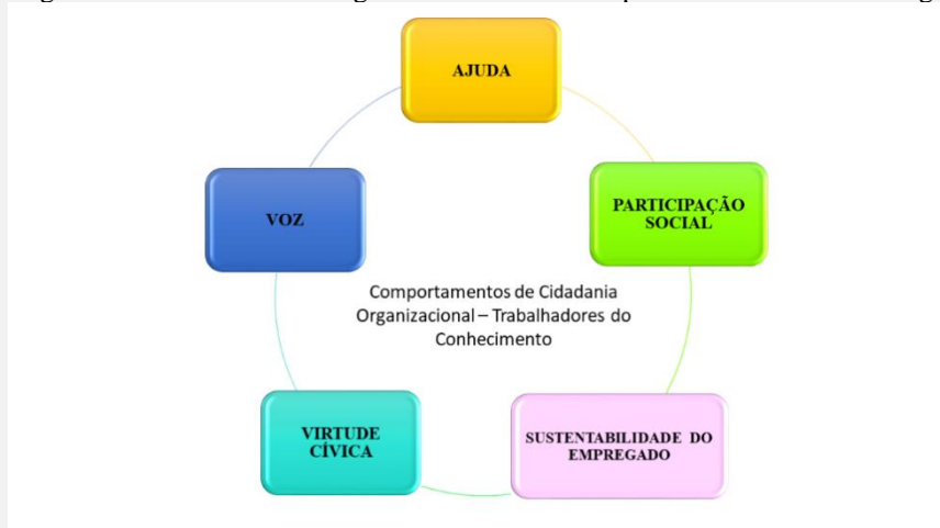
Figure 1 – Dimensions of Organizational Citizenship Behaviors for Knowledge Workers

Source: Prepared by the authors based on Dekas et al. (2013).