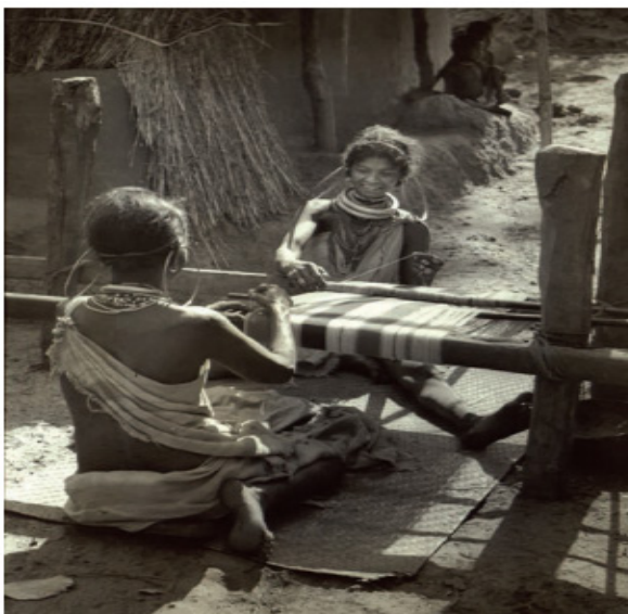
Fig. 8 – Godara women weaving

The first picture on the page shows that two tribal women are facing each other and weaving cloths happily. They are having a conversation and the woman who is facing us is smiling while doing her work. Both of them are wearing jewelry. It is clear from the picture that they are enjoying their work. The title of the picture in the textbook indicates that the women are Godara tribe. However, without mentioning Godara tribe elsewhere, the fourth chapter has selected their picture to help readers understand the problems created by the traders that many tribal peoples experienced in the past.