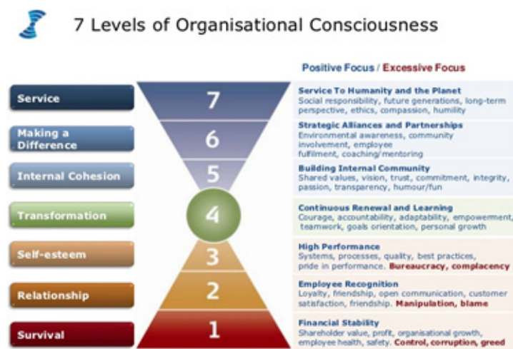
Figure 1. The seven levels of personal and organizational awareness

From needs as described by Maslow, Barrett (2006) developed a model with seven levels of consciousness to measure the values of an organization / company. According to the author the companies and firms with more self-performance are those that establish and preserve a worshiper guided by shared values, which all seek the same future vision, personal fulfillment and meet their physical, emotional, mental and spiritual needs. Barrett (2006) reveals seven levels of personal and social consciousness described in Figure 1.