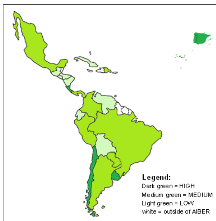
Figure 1. Classification map of the countries of Ibero-America – AIBER

We can say that due to closeness of the results in the ANOVA analysis, grouped to the countries of the clusters 2 and 3 in the table 4, it shows as “MEDIUM” on the ranking scale of countries AIBER. Figure 2 shows the map with the classification countries.