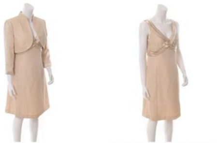
Figure 3 - Day and Night Dress

Here, ‘a Multi-Wear Clothing’, not merely means old clothes for re-processing and reuse, yet it covers finished garments with more functions, more kinds of worn. With the fast pace of life and work, for the need of communication and etiquette, a part of the consumers' clothing need to change at different times at different stages in a day. As illustrated in Figure 3, the popularity of transfiguration day and night dress meets the need of white-collar ladies' work during the day and night at the reception.