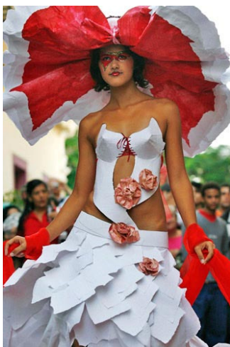
Figure 4 - The Clothing Made by Recycled Paper