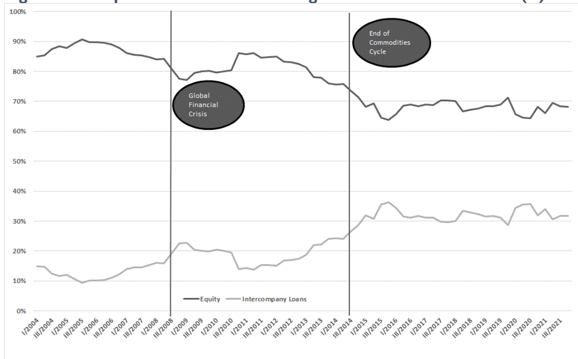
Figure 2: Composition of the total Foreign Direct Investment stock (%)

denominated as debt instruments 11 . In the Figure 2, there has been a rising in debt instruments, which are connected with Multinationals activities in their own value chains. The share of intercompany loans of the total FDI stock increased from 14% in the end of 2010 to 32% by the end of 2021, after reaching a peak of 35% in the end of 2015. This fact highlights the importance of the financial relations for Multinational companies in Brazil as those financial operations have more than double in the last decade. This process can be seen as financialization of the FDI flows.