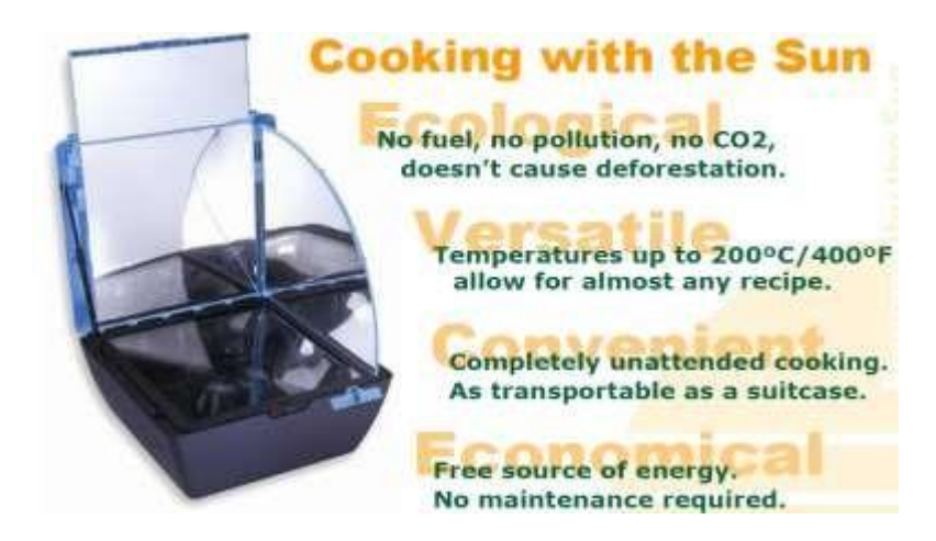
Figure 2 The Sun Cook – Solar Oven by Sun C°. – Cia. de Energia Solar S.A (http://www.sun-cook.com)

This new invention and innovation, inspired in a 1900 technology, is patentable itself, since the solution found is new, it is not contained in the technical characteristics at that time and is not intended for the same use of the previous invention.